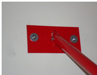
Heavy-duty upper clevis bracket